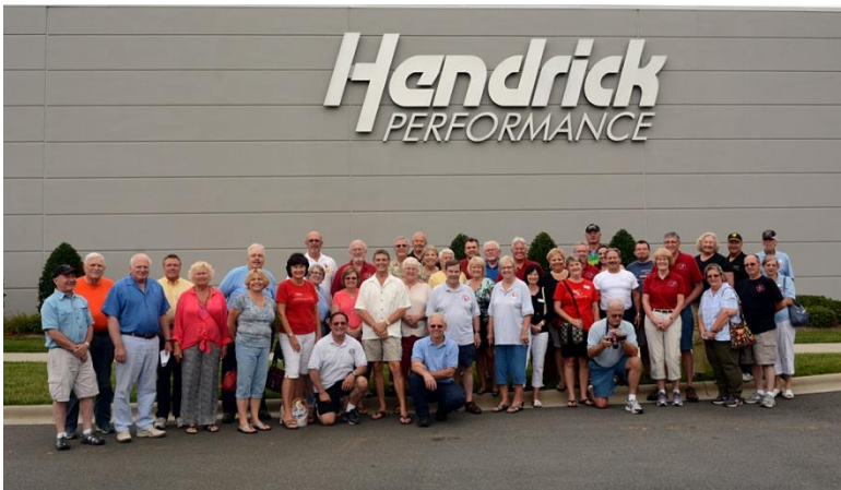
No cameras allowed inside so we did a group photo outside.