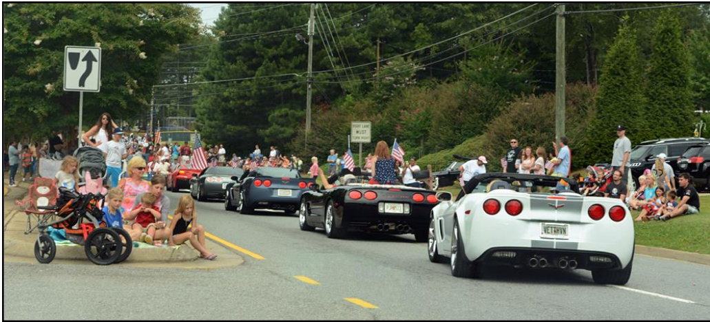
There were good crowds along almost the entire parade route. Everyone waved but as usual the kids were waiting for the floats that were throwing candy their way. We don't do that from our cars.