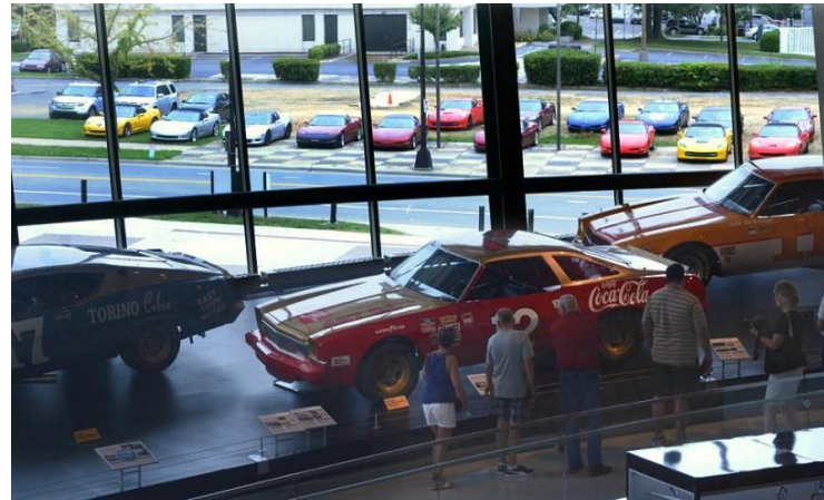
On Saturday we parked right across the street from the NASCAR Hall of Fame and could see our cars from inside.