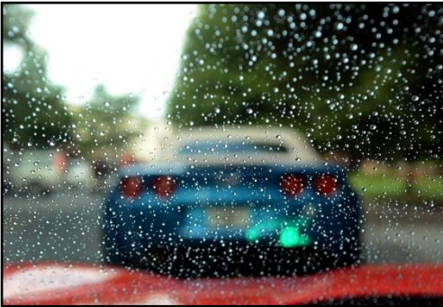
It sprinkled enough at the first staging area to cause some concern, but the parade was dry.