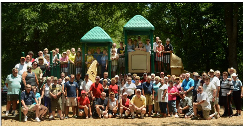
Where's Waldo? This is our annual club group photo.