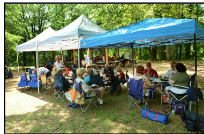
Canopies and large shade trees were great places to eat and tell stories.

Ed's new way to do the food to go with the BBQ brought out the creativity and skill of the cooks in our club. If anyone went home hungry they missed out. We had 52 cars trying to squeeze into the 32 spaces we were allotted. Next year we will have to rent both pavilions. It could not have been a more perfect event.