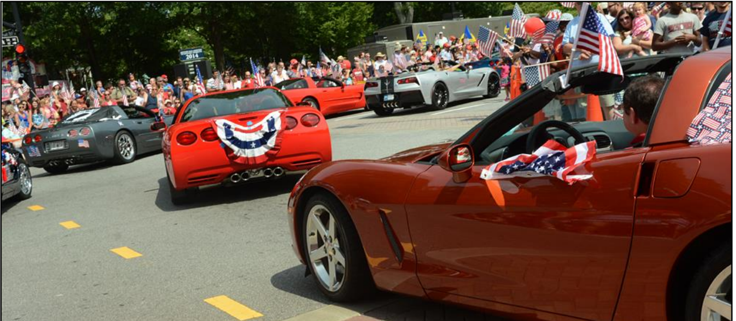
The crowds were good along the entire parade route but the closer we got to the Marietta Sq. the bigger they got. Here we turn onto the Square.