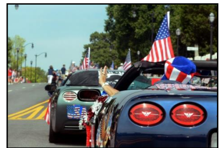
We waved and the crowds waved back. What fun!