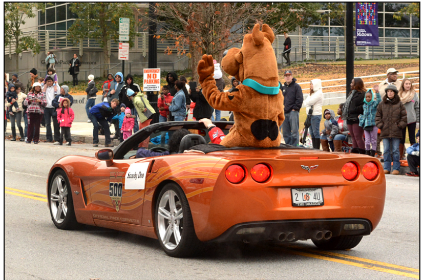
Mana Swope heads down the parade route with Scooby Doo.