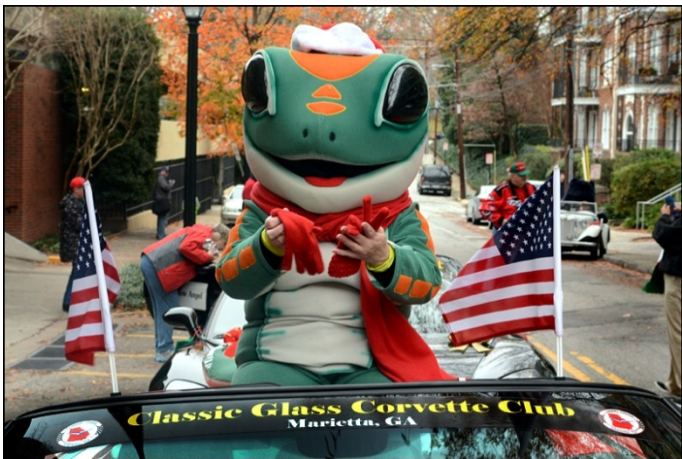
Left: The Geico Gecko puts on the first layer of gloves to try to keep warm