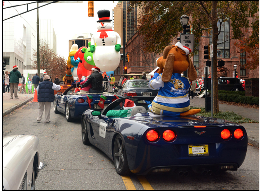
With the cars decorated and the riders loaded, we await our turn in the parade.