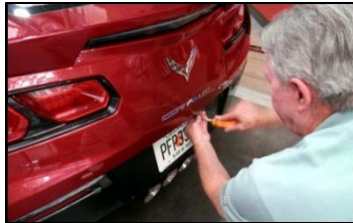
Bobby Turner adds the GA license plate as the delivery starts.