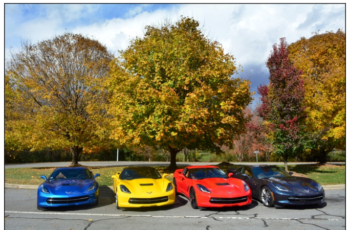
There were 4 new brightly colored C7 Stingrays in the group.