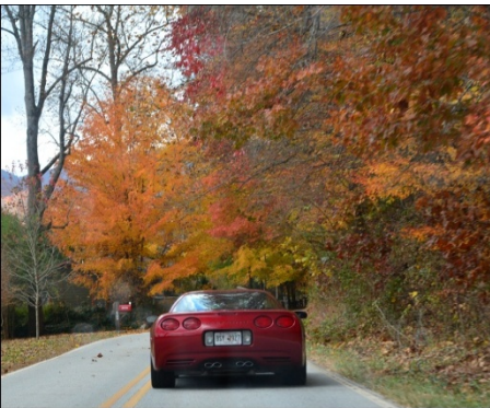
There was some vivid color along our route.