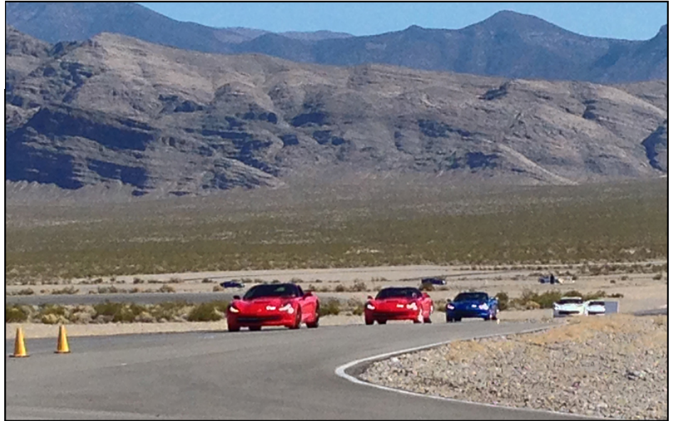
Stingrays run laps on the Spring Mountain road course as part of the Stingray Dealer Academy.

For those fortunate enough to pilot a Stingray around Spring Mountain's road course, life will never be the same.