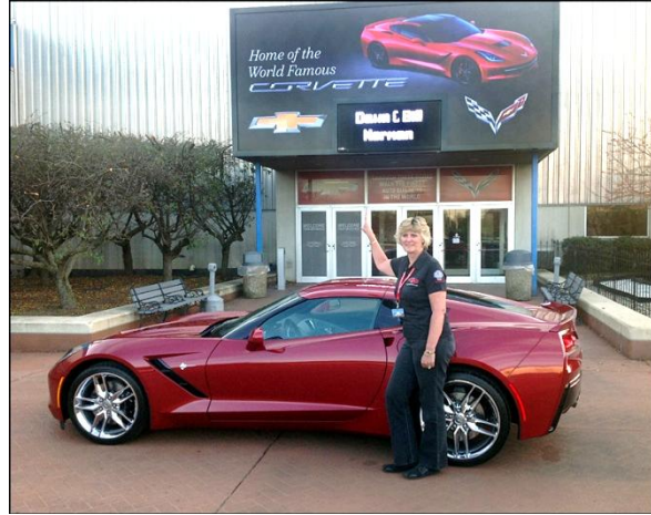
Nothing like having a new C7 and seeing your name in lights at the Assembly Plant