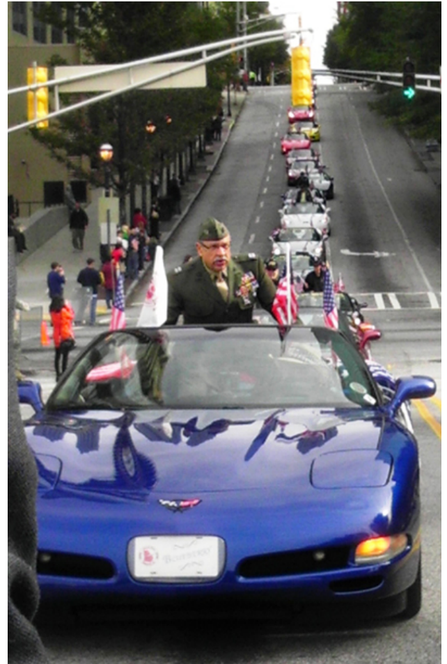
What could be nicer that veterans riding in our cars in the annual Veterans Parade in downtown Atlanta?