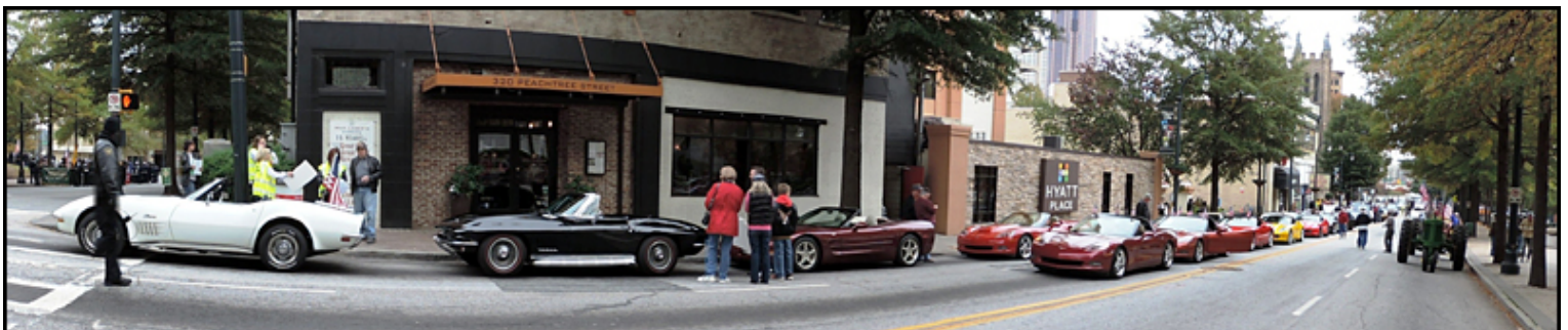
This is a panoramic photo of the Corvettes lined up on Peachtree St waiting for the veteran VIP's to arrive and get the parade started.