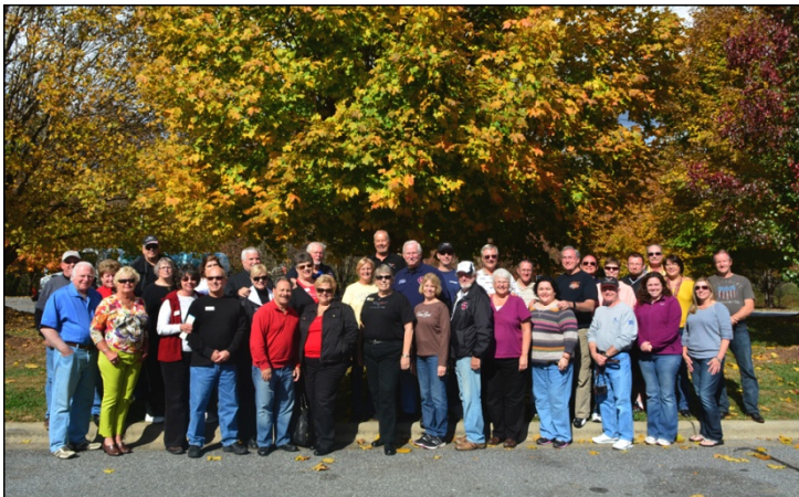
This is a group shot of the leaf cruisers.