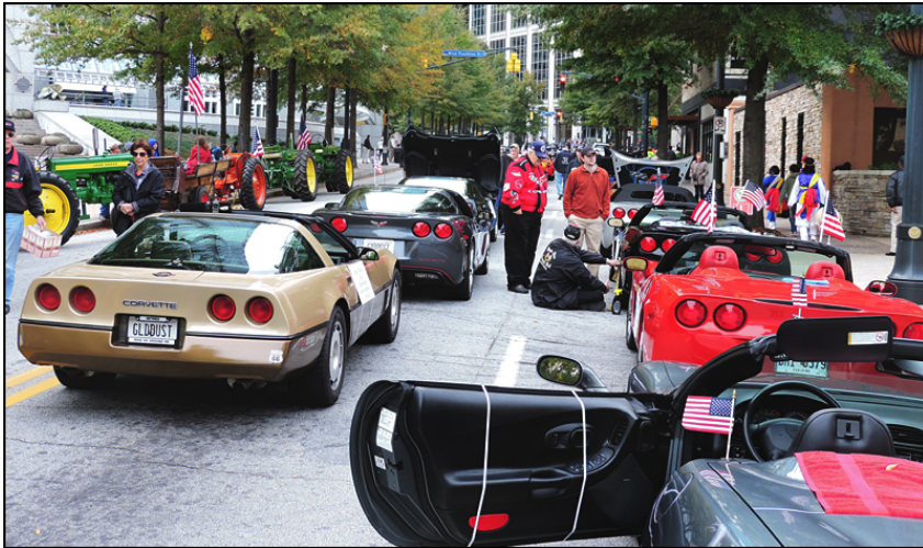
Time before the start is spent socializing and waiting on our riders.