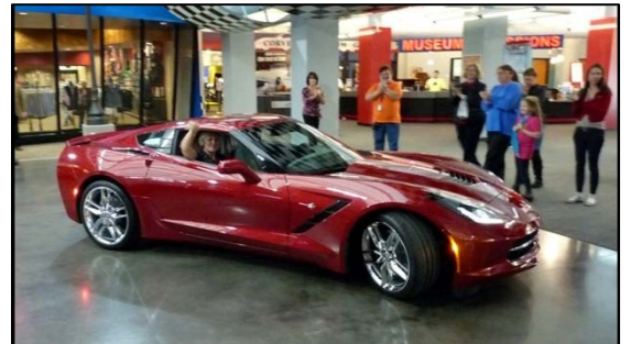
Dawn rides out of the NCM to the applause of visitors and NCM staff. What a great feeling!