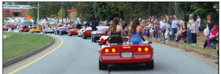
The parade route was lined with students, teachers and proud parents.