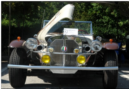
A vintage Mercedes roadster was on display.