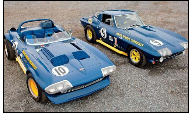
Two examples of 1963 race cars.

didn't dare put the names Chevrolet or Corvette on the car. A deep-sea fisherman, he named it Stingray.