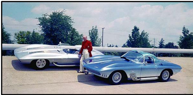
Bill Mitchell poses with a couple of his creations

Mitchell's influence was epic. It included the 1963 Corvette and Stingray race car concepts in the late '50s and, with the assistance of Larry Shinoda, designed the 1961 Mako Shark concept that inspired the landmark 1963 Corvette Sting Ray. In 1965, the Mako Shark II concept from his studio previewed the C3 Corvette.