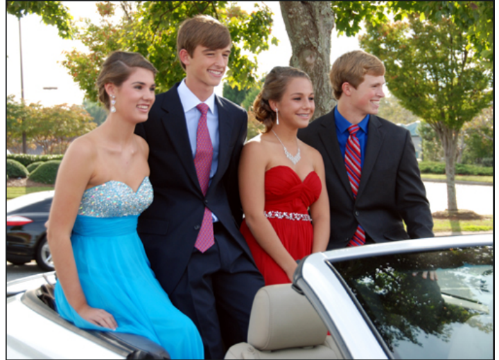
Participants in the Lassiter Homecoming Court got all dressed up for the parade and the evenings events.