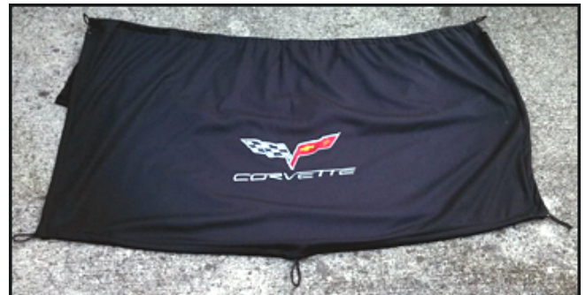
C6 Logo Cargo Shade $40