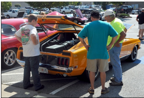
People looked at this mid-engine Mustang.