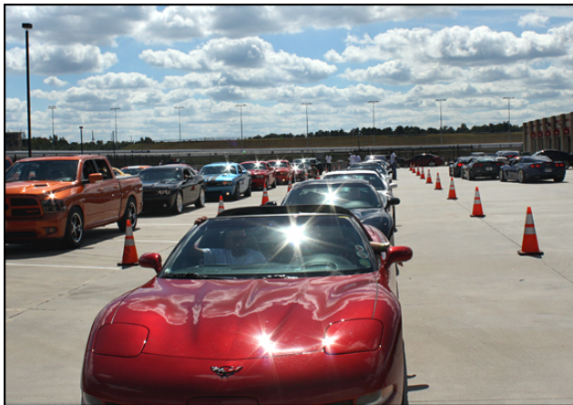
The Corvettes were joined by Porsche's, Mustangs, and others.

CGCC made a $250 donation to the fundraising effort.