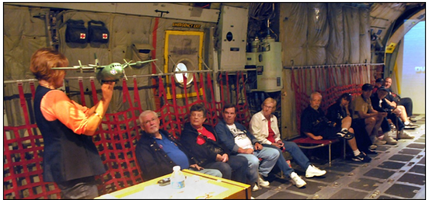
Our tour guide used a C-130 Hercules model to help explain the airplane and the real cargo area we were sitting in. Note the cargo netting seats on the side.