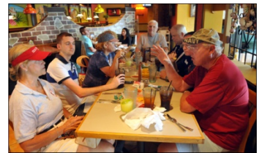
A group gathered for a Mexican lunch after the parade.