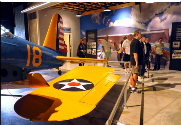
The group learns about the training of the Tuskegee Airmen.