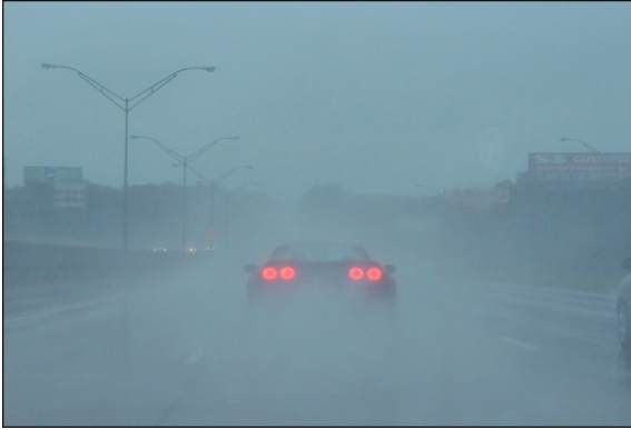
Honest, there was a line of Corvettes somewhere in the spray and rain as we headed for Warner Robins.