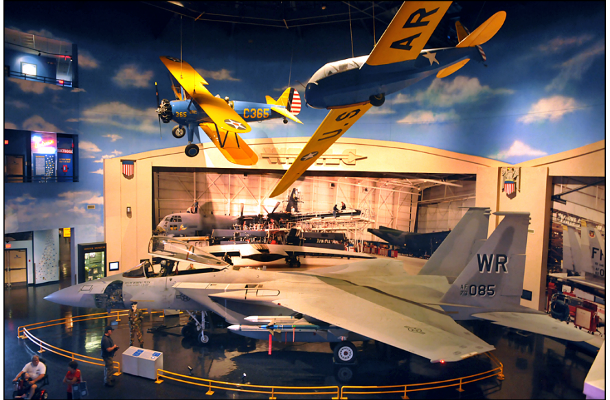
This F-15 Eagle was the center piece in the first building we visited. It just set the stage for everything else we would see and learn about on our guided tour.

The rain did not keep us from an enjoyable drive, lunch and tour through the Air Force Museum in Warner Robins. There were some amazing displays of air planes and informational displays throughout the five buildings. Unfortunately the weather kept us from making photographs of our cars and the airplanes outside. Next time for sure.