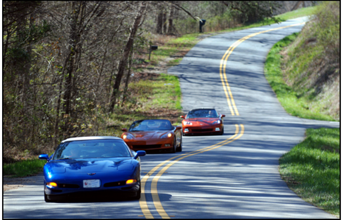
This year's route, as in the past, included some curvy 'corvette' roads between check points.