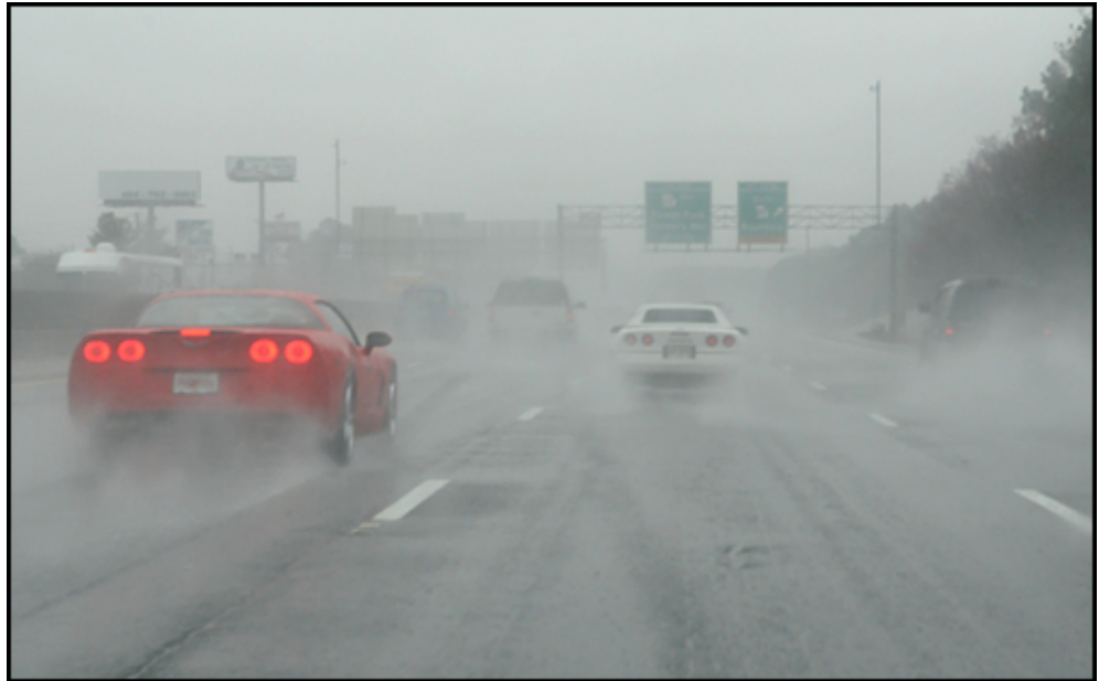
It was a wet and messy drive all the way to Summit Racing. All the spray coming up did not help either

Afterward it was a nice rain free cruise