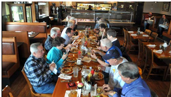
Lunch was at Barnstormers Grill at the Peach State Aerodrome (Candler Field) in Williamson, GA.