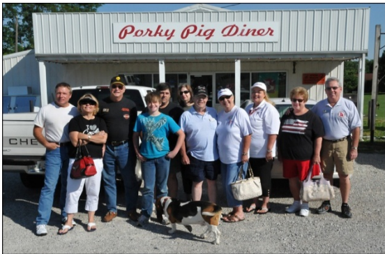
The group before breakfast at the Pig Sunday morning.